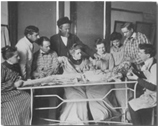
Class of 1904 Dissection Photography Dr. A.T. Still in center Donor: Museum Collection [PIC-DIS-1]